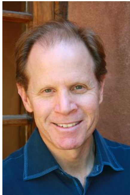
Dr. Dan Siegel

Dr. Siegel serves as the Founding Editor-in-Chief for the Norton Series on Interpersonal Neurobiology. He is also the Director of the Mindsight Institute, an educational organization that focuses on how the development of insight and empathy in individuals, families and communities can be enhanced by examining the interface of human relationships and basic biological processes. Dr. Siegel's integrated and accessible developmental approach has led him to be invited to local, national and international organizations to address groups of educators, parents, public administrators, healthcare providers, policy-makers, clergy,